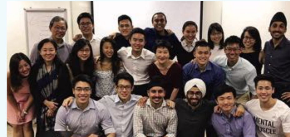
Mental Muscle 2.0 (front row) handed over the reins to Mental Muscle 3.0.

Mental Muscle 3.0 is a student-led initiative run solely by medical students and 1 August 2017 to 30 July'18 will be our third successive year. This year, with a total of 16 members spanning three cohorts of medical students, our project aims to generate public awareness for mental conditions and clarify misconceptions surrounding individuals battling mental conditions on an even greater scale than previous efforts. Our local endeavours include hosting talks, road-shows and workshops at teaching and work-related institutions, as well as engaging individuals in public spaces and radio talk-shows. This is in addition to managing social media, fundraising pages online and hosting engagement runs.